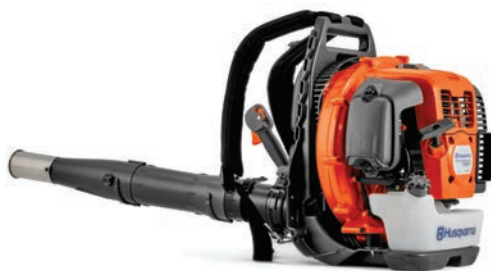
Husqvarna's 578BTF blower.

single-purpose machines, suitable only for fires. The fact is that they give the user a one-stop solution for all his blowing needs. For when not in use during fire