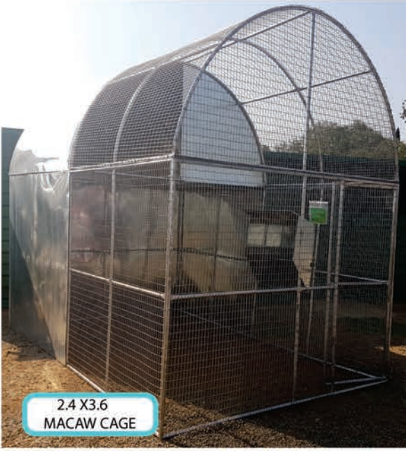
2.4 X3.6 MACAW CAGE