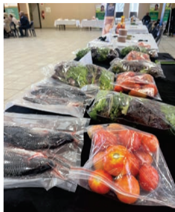
Produce growing (left) and packaged, ready for sale, including whole tilapia (right).