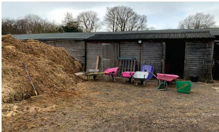
Stables tend to produce a large amount of waste and manure.

Waste management: Stable yards tend to produce large amounts of manure, with the concomitant possibility of flies. Make sure you have the means to deal with this. This can be a designated area (larger than you think) to start a compost heap, or you can contract out to a waste removal company once a week. Or, this could form a second stream of revenue in the sale of the manure.