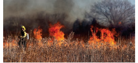
Fires need oxygen and combustible material to burn.

But we can control the amount of combustible material available, by cutting and removing dry grass, and cutting and removing other vegetation, such as dry wood, brush, dead trees and fallen leaves before the fire season starts. 🌿