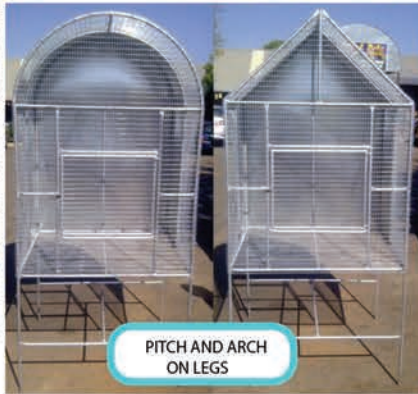
PITCH AND ARCH ON LEGS