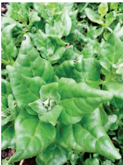
NZ spinach in the author's garden. Tough, fast growing and productive.

This fast-growing groundcover looks a lot like a true spinach although it is actually in the same family as