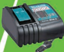
AUTOMOTIVE CHARGER DC18SE

Charge times are longer when using the DC18SE