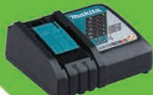
FAST CHARGER DC18RC