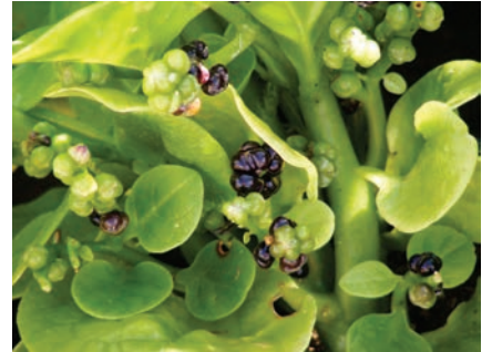
Ceylon spinach with fruit.

❑ Malabar and Ceylon Spinach ~ These small creepers are grown in truly tropical countries where true spinach and even Swiss Chard are out of the question due to the climate. They are adaptable and productive. Both belong to the same species, Basella alba , a semi-succulent plant with large leaves and small, black berries that