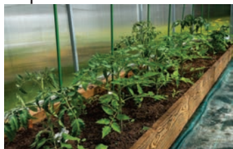
Growing tomatoes indoors.

Select the right vegetables: Some vegetables require less sunlight than others. Leafy greens such as spinach and kale can grow in partial shade, whereas fruiting vegetables such as tomato and pepper require full sun to thrive.