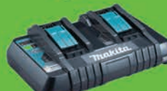
TWO PORT MULTI FAST CHARGER DC18RC

Charge times are longer when using the DC18SE