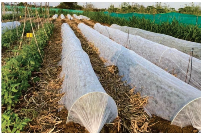
Row covers will help retain heat.

❑ Cauliflower ~ Like other brassicas, cauliflower can be grown in cold temperatures. It is a source of Vitamins C and K, and antioxidants. Cauliflower prefers well-drained soil and plenty of sunlight. It can