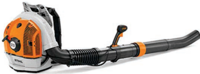
Stihl's BR 700 blower.

The downside is that the popularity of blowers as firefighting implements has surpassed the level of knowledge of those who use them, with the result that smaller capacity machines are being bought for fire duties when in reality they should be restricted to blowing leaves.