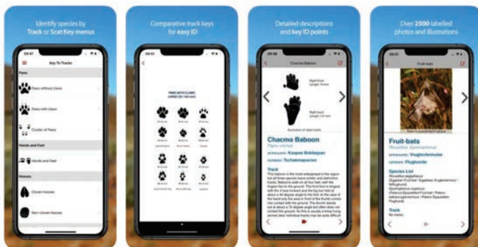
Screenshots from the app.