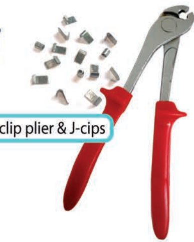
J-clip plier & J-cips