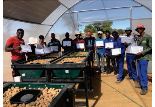
A successful aquaponics training course run by AquaPro™.

AquaPro™ also provides training and workshops all over South Africa, Namibia, DRC and Zambia, making it accessible to a wide range of learners.