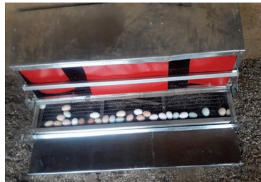
Egg tray, pictured bottom, can be removed and mounted on the rear of the house.

Although a laying box only 1,2m wide would seem small for the needs of 50 chickens, Jacobs points out that they are not all in the