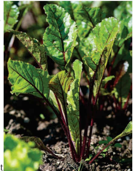
Beetroot leaves and bulbs are edible.

❑ Swiss chard ~ Often mislabelled in shops as spinach, Swiss chard is the large, curly leafed vegetable sold in bunches on every street corner and in every supermarket. It