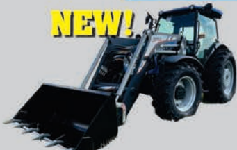
DT90 with front loader