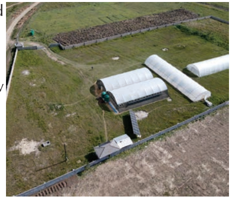
Aerial view of one of Green Arch Innovations' three systems.