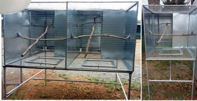
BREEDING SUSPENDED AVIARIES